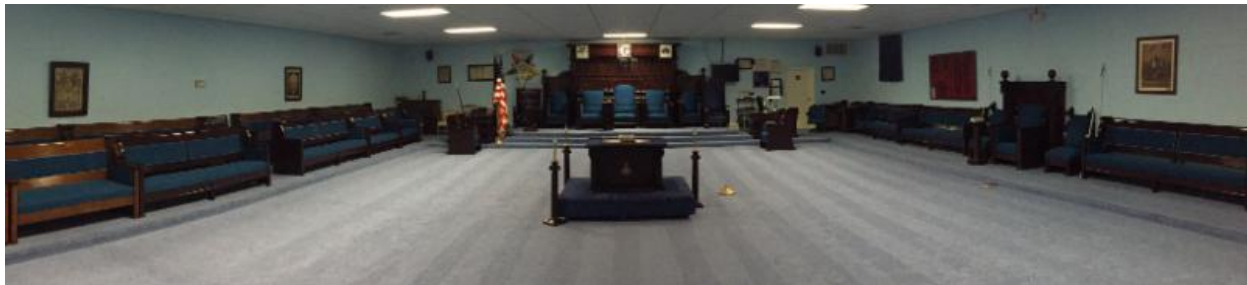
Jackson-Coolidge Masonic Center Lodge Blue Room